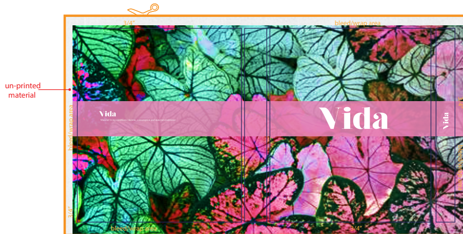
Incorrect placement of artwork on template